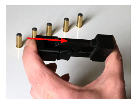
Step 2: Press the top of the loader down