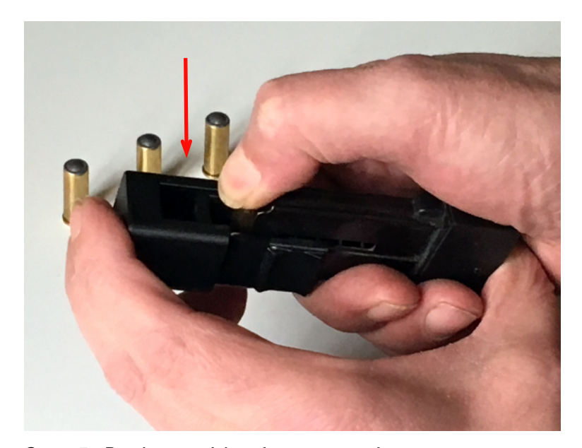
Step 5: Push cartridge into magazine