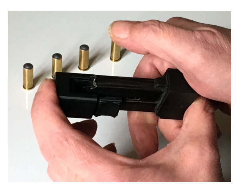
Step 6: Repeat steps 1-5 USE SILICONE GREASE WHEN NEEDED