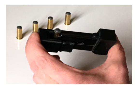
Step 3: Insert base of cartridge into top of magazine